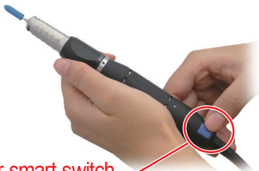
Motor smart switch